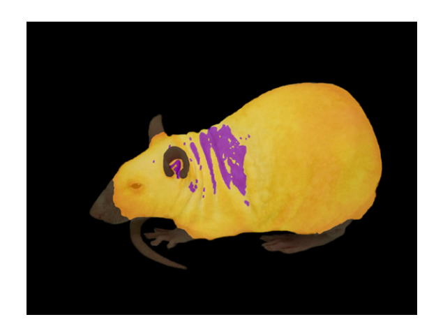
Figure 2 Two types of skin in a rat. Two images of a genetically hairless (Crl:CD-Hrhr) rat exposed to cold are overlaid. The bottom layer is a regular (visible spectrum) photograph. The top layer is a transparent infrared thermogram. In the thermogram, temperatures from 31.0 to 37.0 °C are coded with yellow (from dark to light respectively), temperatures below 31.0 °C are coded with black, and temperatures above 37.0 °C are coded with purple. As a result, the vasoconstricted skin over the heat-exchange organs shows as black, whereas the skin over the rest of the body is yellow. The external acoustic meatus and the skin over interscapular brown adipose tissue have higher temperatures and show as purple.

The proximally located and insulated hairy skin seems to be a bad place to assess ambient temperature. Indeed, no one would think that putting a thermometer under the clothes of a warmly dressed man on a cold day would give an accurate reading of the ambient temperature. Sticking a thermometer under the fur of a polar bear may not work well either. Furthermore, temperature in some areas of the hairy skin, for example the rostral back in the rat, is strongly affected by the thermogenesis in the underlying brown adipose tissue (Marks et al. 2009) (also see Fig. 2). An important fact from the clinical point of view is that temperature of hairy skin in the body's nooks and crannies (e.g. the external acoustic meatus and axilla) often approaches